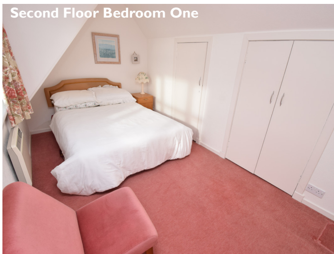
Second Floor Bedroom One