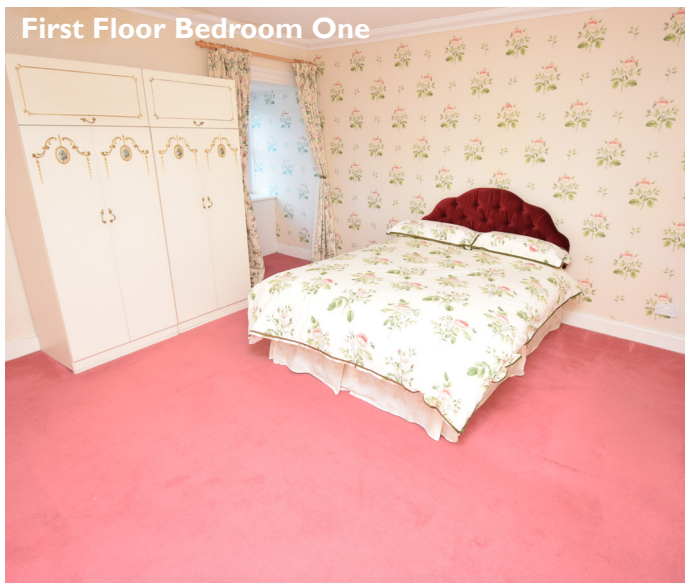
First Floor Bedroom One