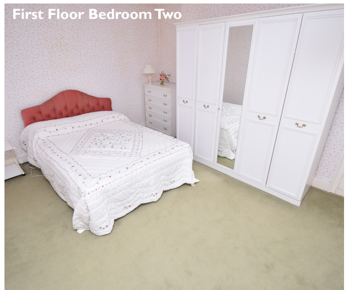
First Floor Bedroom Two